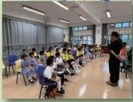
準小一樂器體驗班